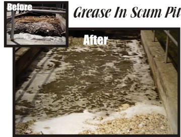
Grease in a Scum Pit:

Six foot deep grease accumulation eliminated in thirty days!